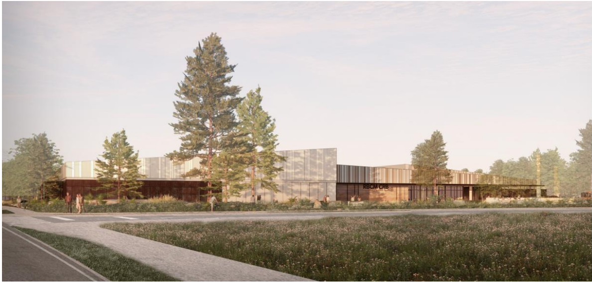
Exterior rendering, view from Metchosin (North)