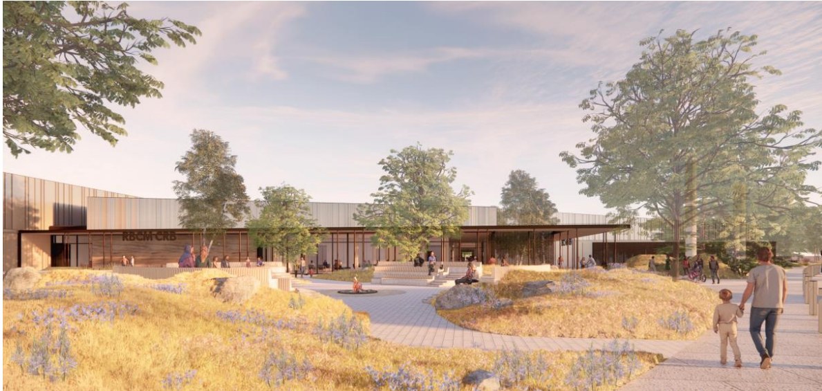
Exterior rendering, main entry approach