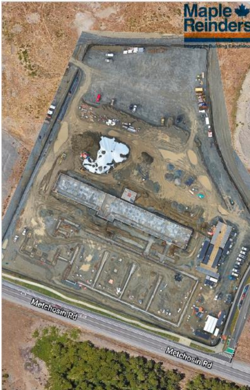
Drone photo taken January 2024