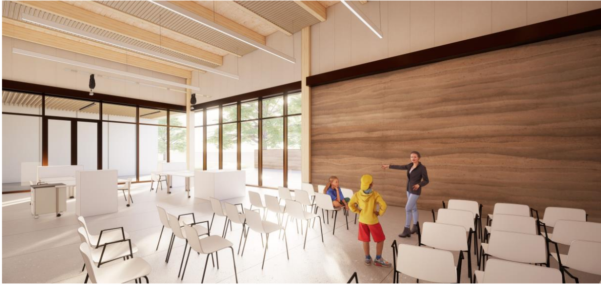
Interior rendering, learning lab