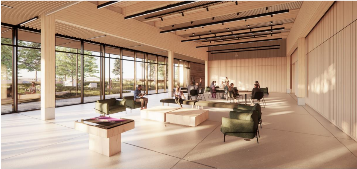
Interior rendering, Lobby