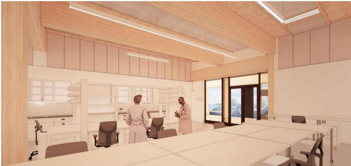
Interior rendering, typical lab