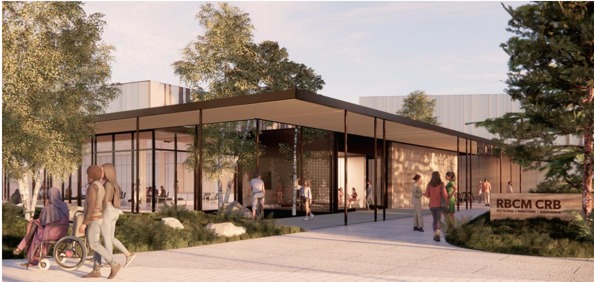
Exterior rendering, public entry plaza