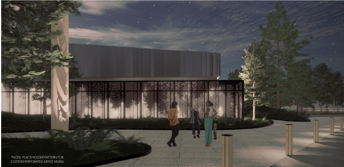
Exterior rendering, integrated mural