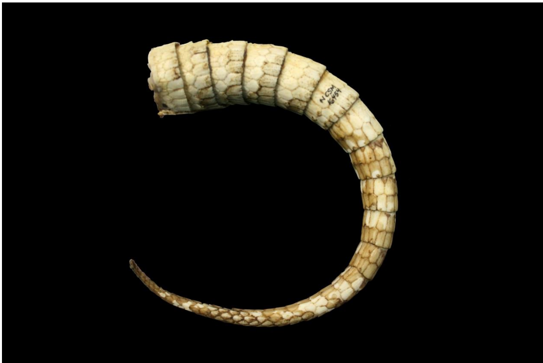
Modern armadillos (like the nine-banded armadillo shown here) have flexible tails covered in bony rings, but some of their extinct relatives, the glyptodonts, had stiff tail clubs that might have been used as weapons.